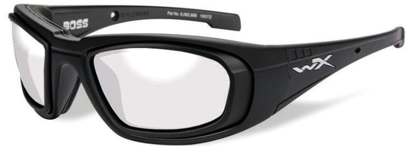
Facial Cavity Seal