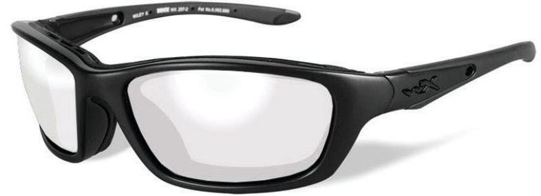
Facial Cavity Seal