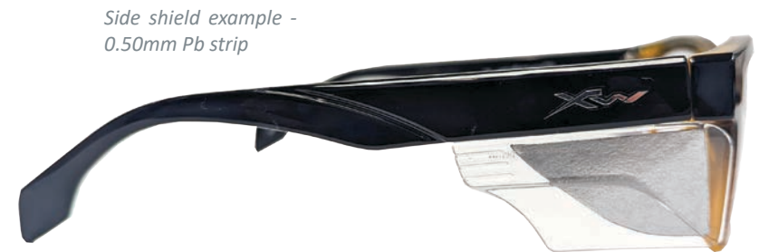
Side shield example - 0.50mm Pb strip