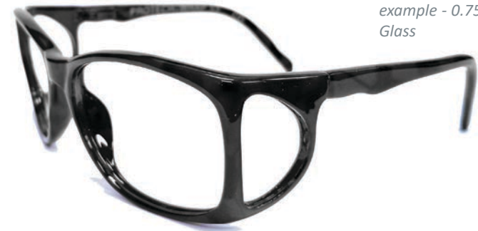
Fig A - Side shield example - 0.75mm Pb Glass

Many of our frames come with side shields for maximum protection. There are two types of side shields - glass and vinyl strips. For both the vinyl strips and glass side shields, the standard protection is 0.50mm Pb. Some frames are able to accommodate a 0.75mm Pb glass, such as the 53 Wrap shown here (Fig A.).